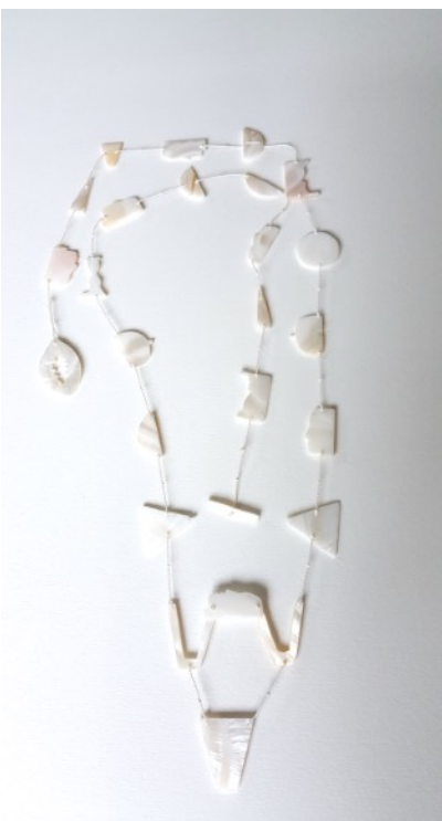
Her, Me, She, Maiden, Mother, Crone 2019 Neck piece Mother of pearl, perling silk thread 400mm x 30mm $300