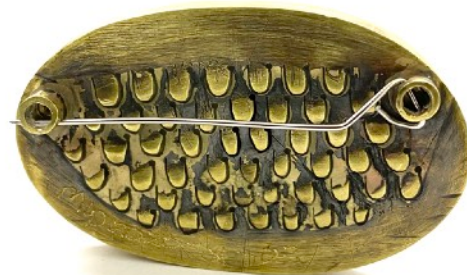
New Zealand Grayling , 2020, Brooch, Brass, gypsum plaster, pigment, epoxy resin, steel pin. 35mm x 57mm x 12mm.