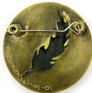
Hawkins' Rail , 2020, Brooch, Brass, gypsum plaster, pigment, epoxy resin, steel pin. 50mm x 50mm x 12mm.