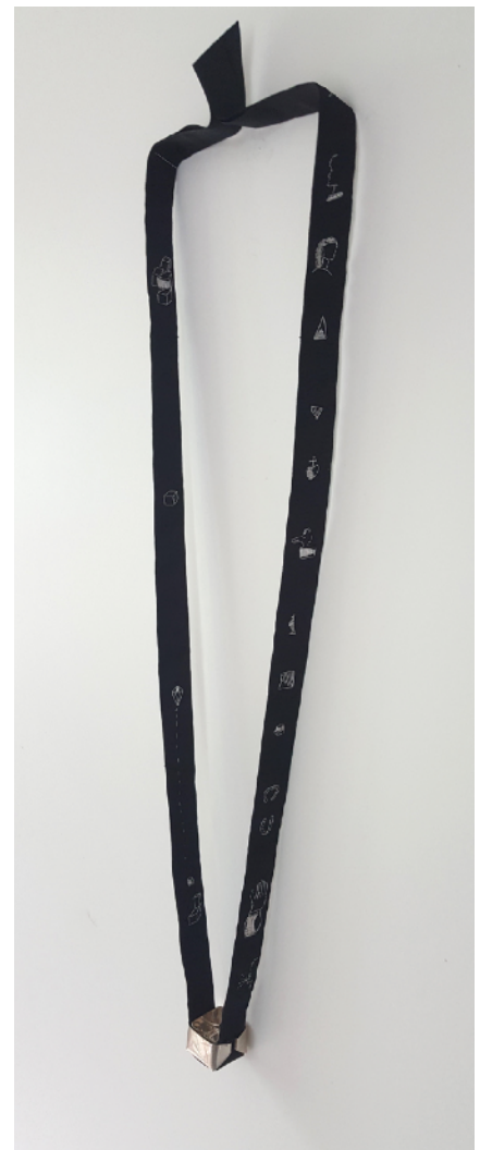
Dust Collector 2016 Neck piece Ribbon, silk thread and sterling silver 400mm x 50mm $250