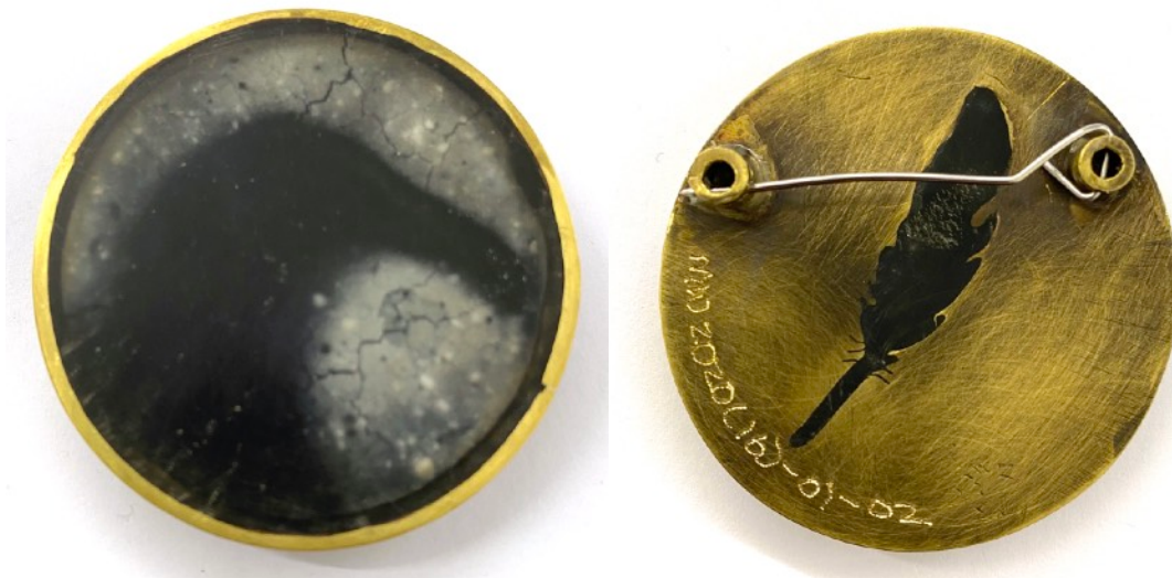
New Zealand Merganser , 2020, Brooch, Brass, gypsum plaster, pigment, epoxy resin, steel pin. 50mm x 50mm x 12mm. $450