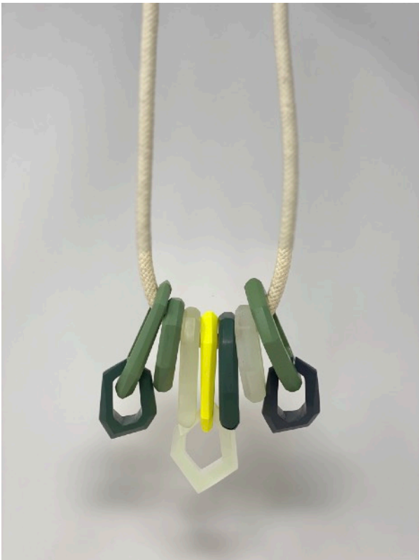
Top Left: 23 Link Necklace 2020 Neck piece Resin and pigment 450mm x 200mm $1,740