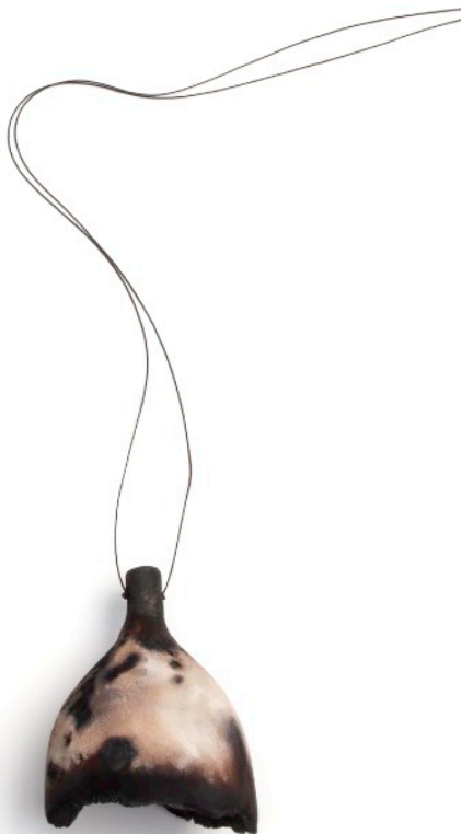
Bottom right: Untitled IX , 2019, Neck piece, Burnt wood, paint, silver, synthetic cord. $690