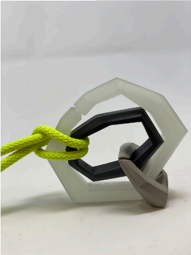
Three Links and a Cord 2020 Neck piece Resin, pigment and textile 110mm x 450mm $315