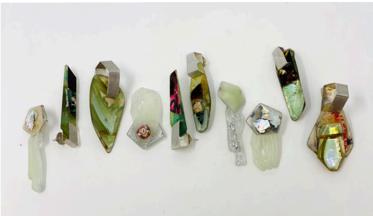
Five pairs pictured: Slight Glitch Earrings , Broad Glitch Earrings and Rom Key Earrings and Rom Shell Earrings . All earrings are: Sterling silver, Rom and Rom Scrolls. 60mm x 20mm. $350 per pair.