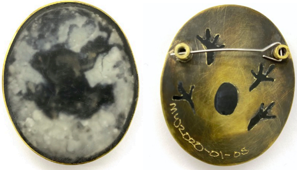
Markham's Frog , 2020, Brooch, Brass, gypsum plaster, pigment, epoxy resin, steel pin. 58mm x 48mm x 12mm. $450