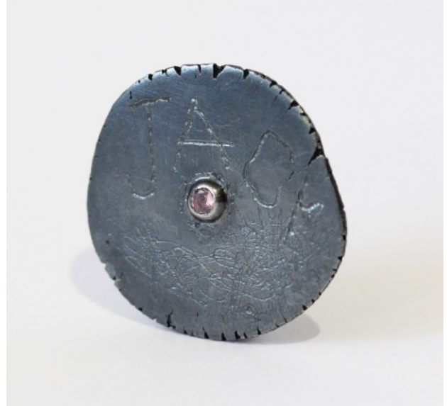
Left: Brustwarze #2, 2020, Brooch, Sterling silver, cubic zirconia, stainless steel pin. 35mm x 35mm x 5mm. $300