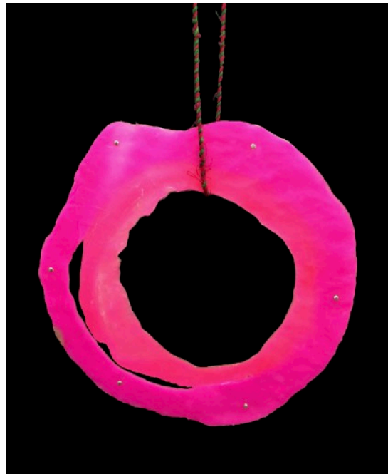
Top left: Lure , 2019, Neck piece, Sterling silver, plastic, plaited waxed cord. 81mm x 75mm. $280 Top right: Envy , 2019, Neck piece, Sterling silver, plastic, plaited waxed cord. 59mm x 62mm. $250 Bottom left: Smear , 2019, Sterling silver, plastic plaited waxed cord. 81mm x 75mm. $280 Bottom right: Lust , 2019, Neck piece, Sterling silver, plastic and hemp cord. 106mm x 100mm. $280