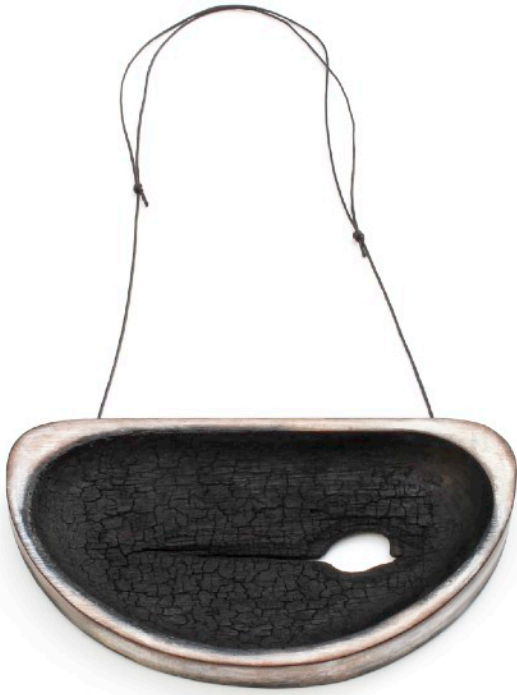
Top left: Untitled VIII , 2019, Neck piece, Burnt wood, paint, silver, synthetic cord. 90mm x 160mm x 20mm. $690