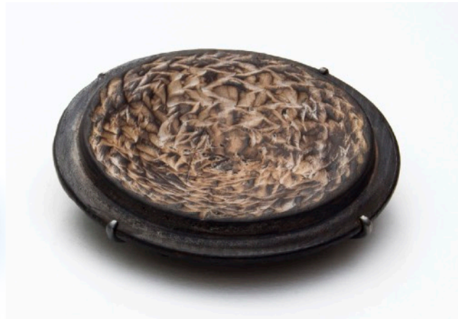
Left: Untitled I , 2018, Neck piece, Burnt wood, paint, copper, sterling silver, leather cord. 102mm x 100mm x 22mm. $540