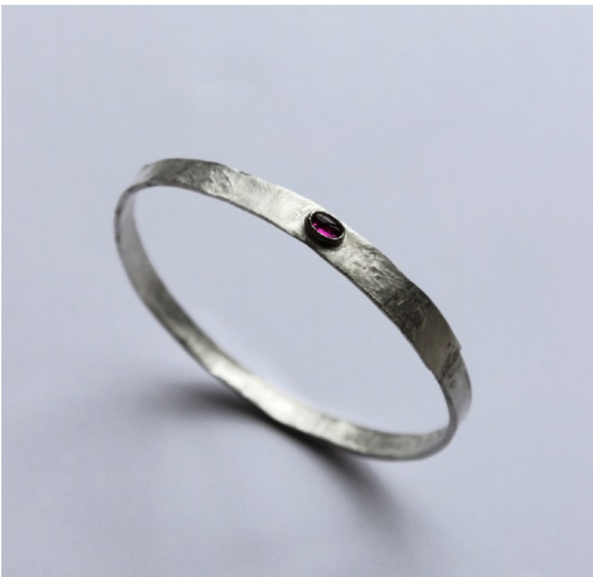
THE FIRST BRACELET I HAVE EVER MADE