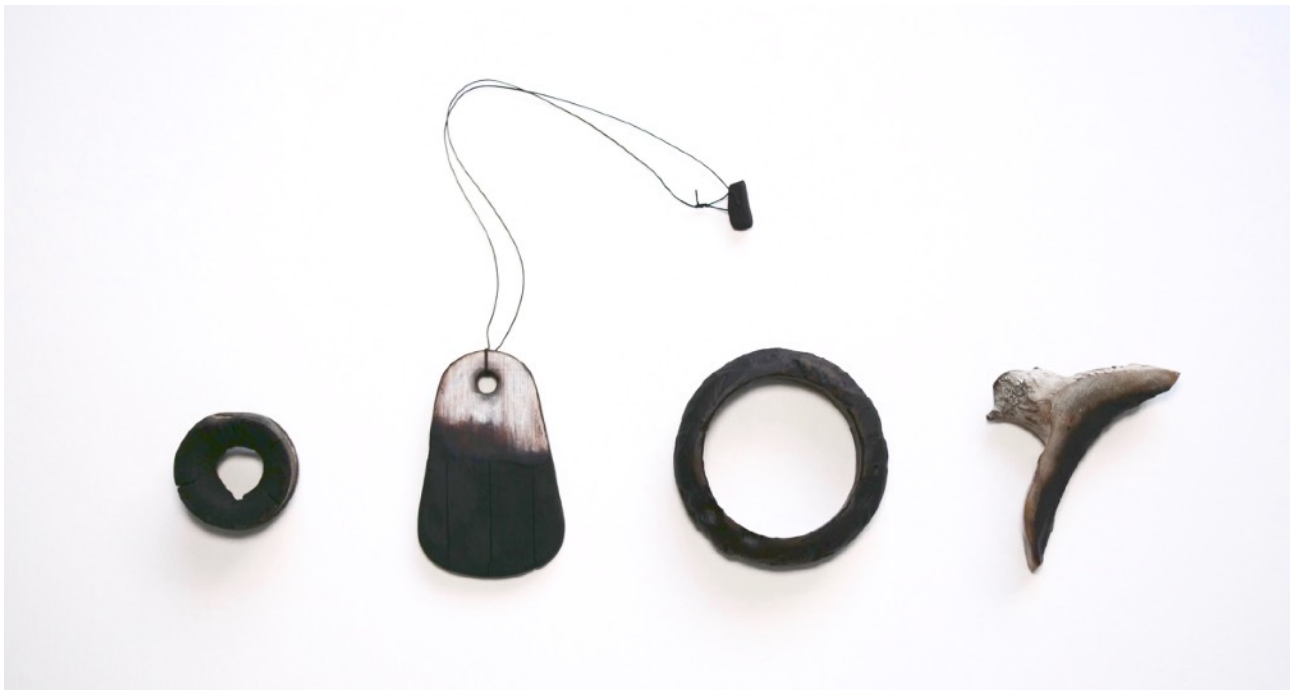
Right: Untitled VII , 2019, Brooch, Burnt wood, paint and sterling silver. 80mm x 80mm x 15mm. $540

From left to right, all works are from the series 'A Collaboration':