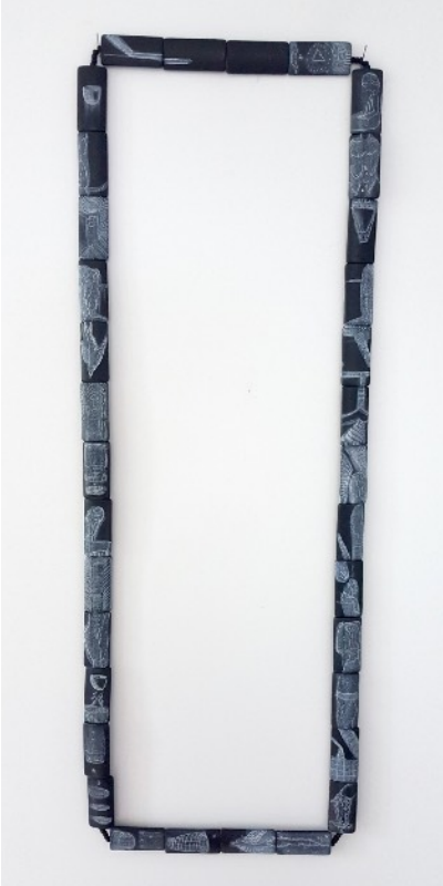
The curse of no little death 2020 Neck piece Wood, ink and silk thread 500mm x 200mm $300