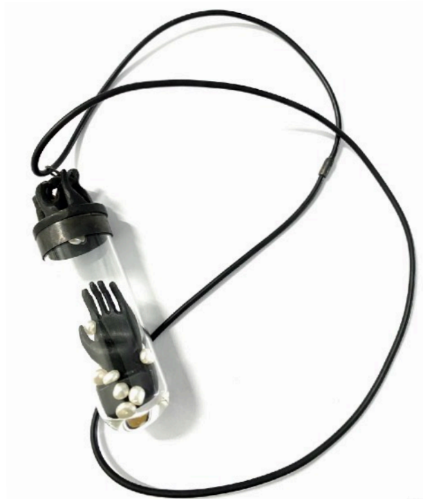
Right: The Welcome , 2019, Ebony, pearls, oxidised sterling silver, glass and rubber. 390mm x 23mm. $620