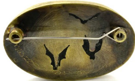
Great Short Tailed Bat , 2020, Brooch, Brass, gypsum plaster, pigment, epoxy resin, steel pin. 36mm x 55mm x 12mm.